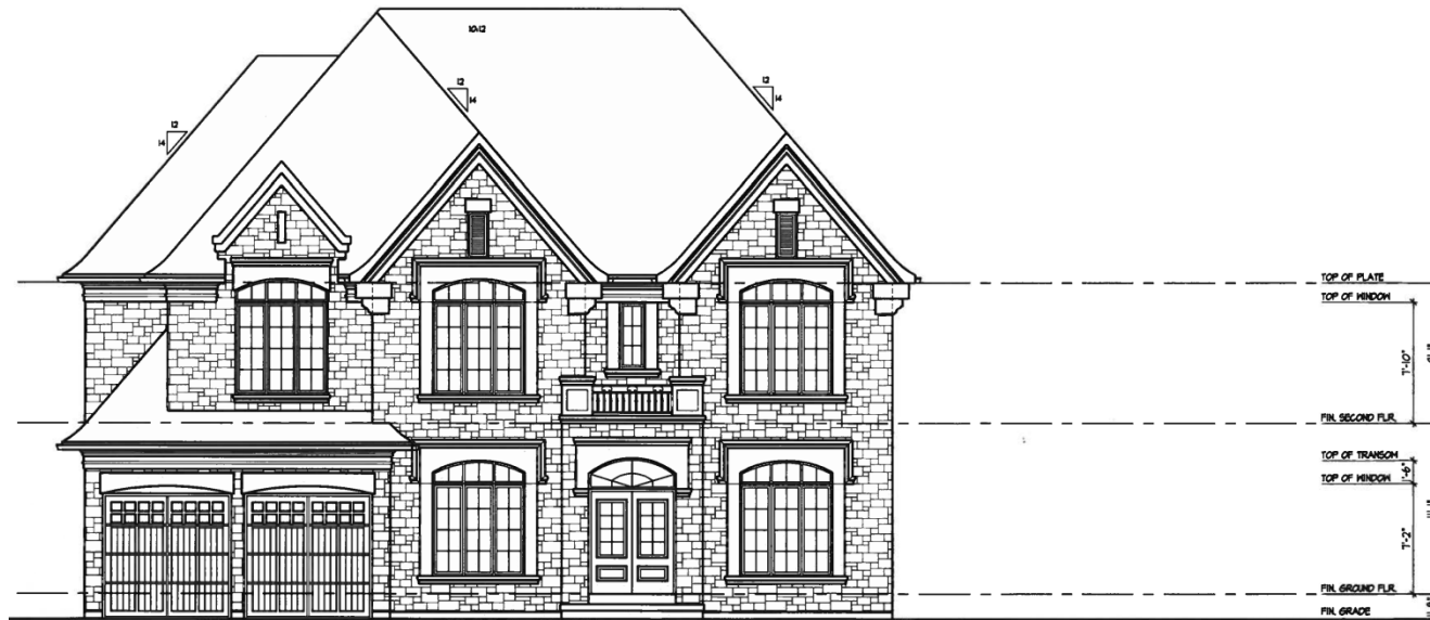
FRONT ELEVATION 'A' - ENGLISH