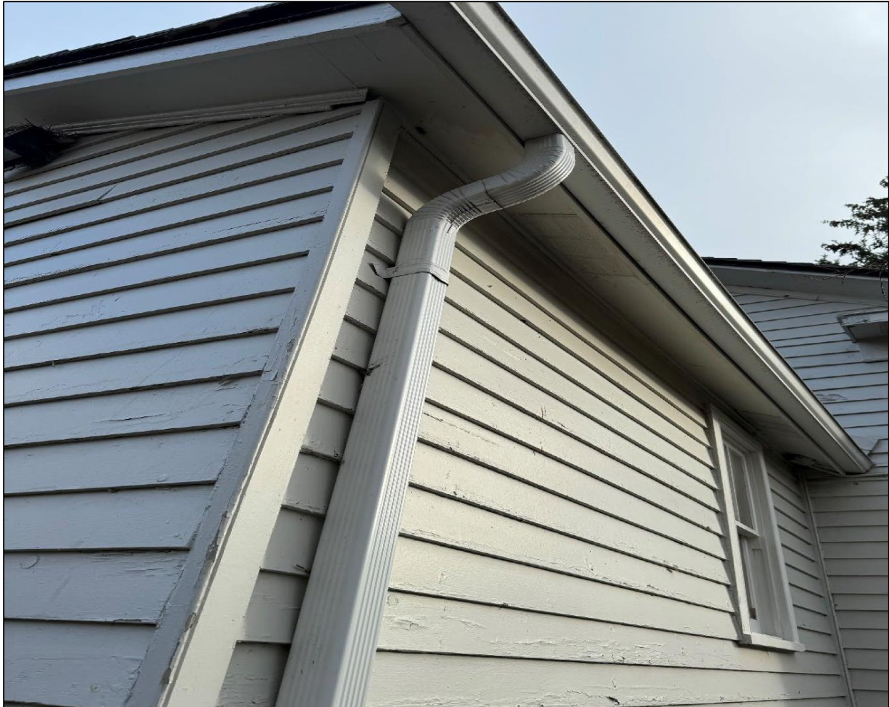
Figure 6: Typical soffit showing rust and fading.

The aluminum soffits along the roof show signs of deterioration due to weather and the collection of moisture. Signs of deterioration include visible rust and fading. Damaged sections will be removed, and new materials will be installed to restore functionality and aesthetics. The soffits will then be repainted.