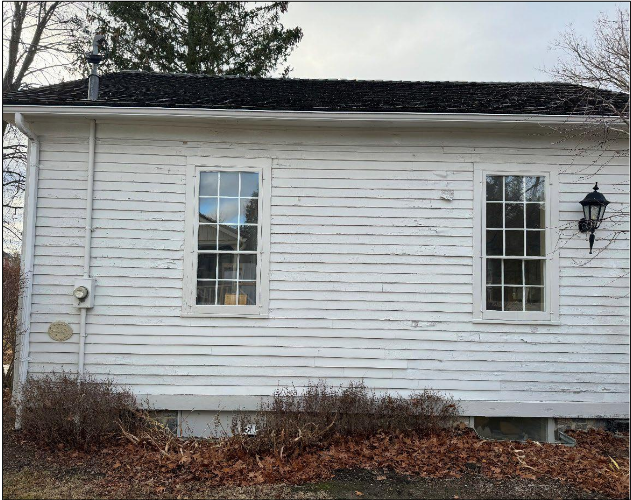
Figure 2: East elevation showing peeling paint

A fresh coat of paint that matches both the type, texture, and colour of the existing paint will then be applied.