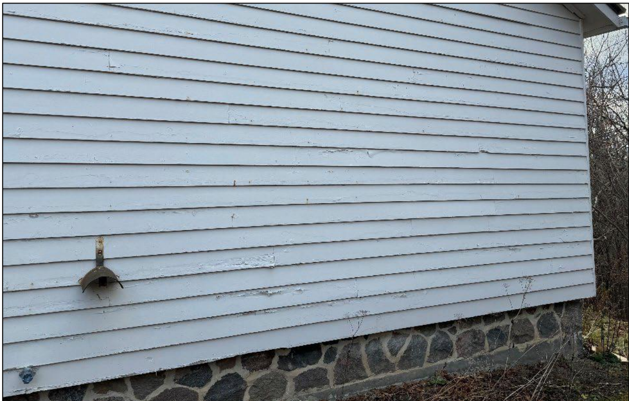
Figure 5: Siding along north elevation showing peeling paint, chipped and damaged siding.

The wood siding exhibits faded and peeling paint, as well as cracks between the skirting board and corner trim. Small cracks or holes will be filled in with a sealant. Sections of siding that exhibit deep or extensive damage will be replaced with new clapboard siding. Areas that were repaired will then be cleaned and sanded down to create a seamless finish and to assist with durability. Once the siding is repaired, a new coat of paint will be applied.