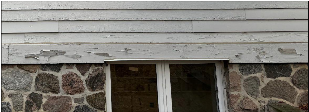
Figure 4: Typical skirting exhibiting peeling paint, deterioration.