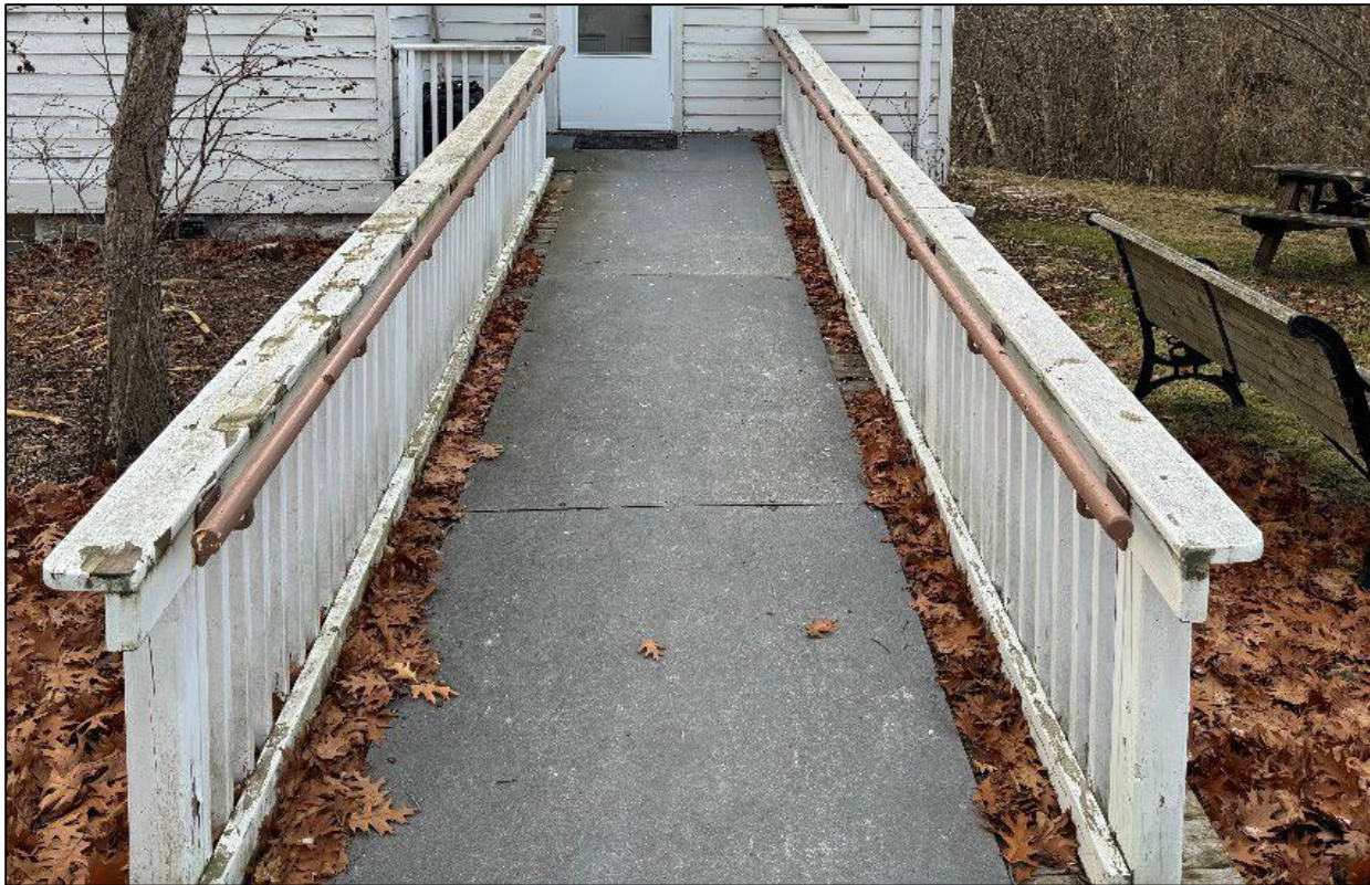
Figure 7: Handrail showing areas of peeling paint, damage.