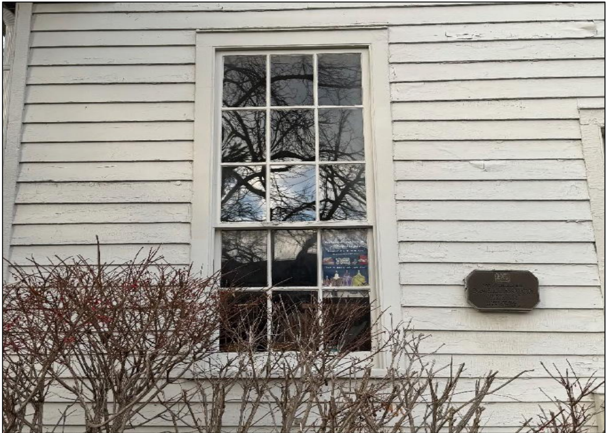
Figure 3: A typical window showing cracks and peeling paint.