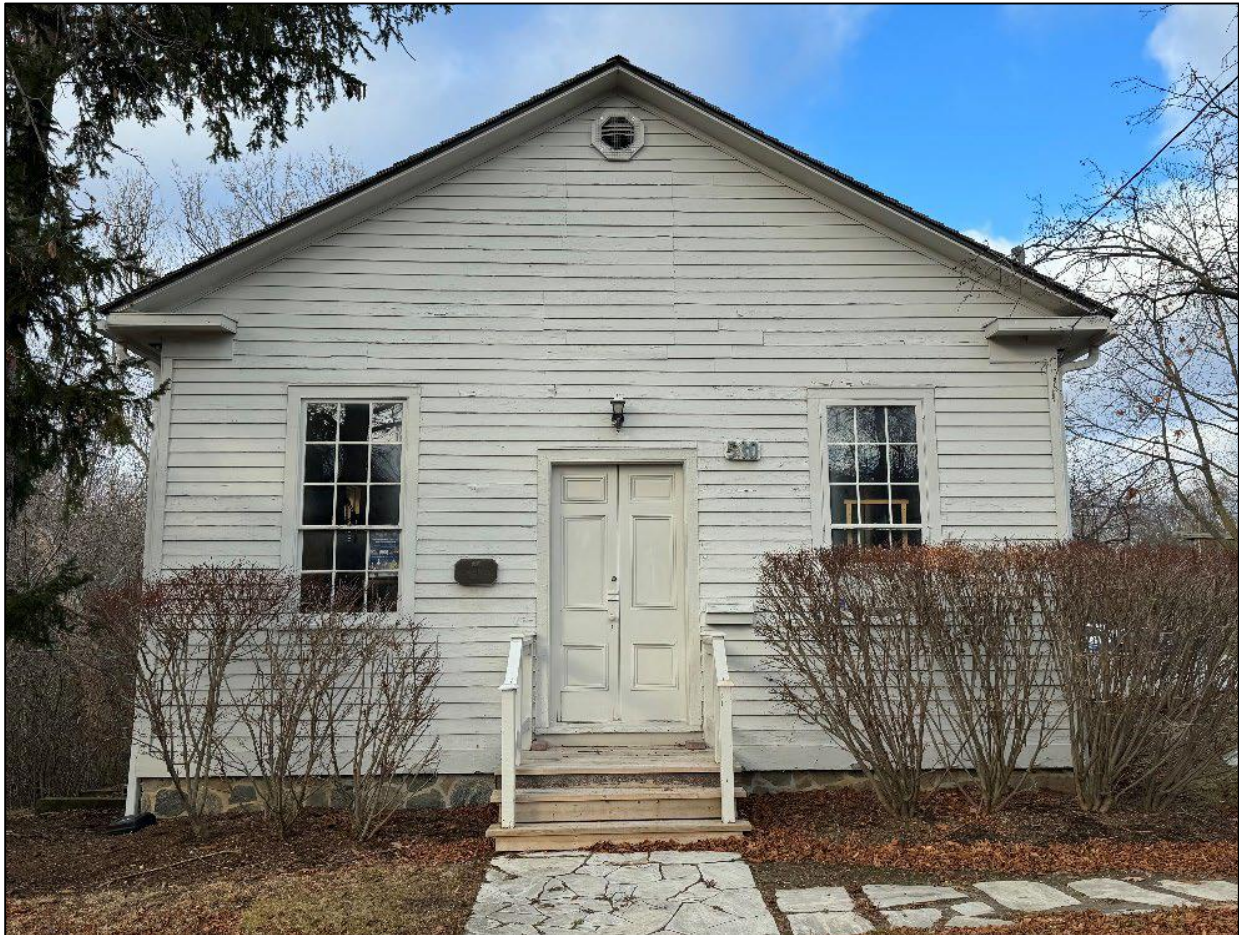
Figure 1: Front (south) façade of Guild Hall.